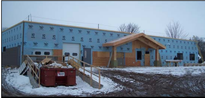
The new Food Pantry, warehouse & office building is taking shape!

As an extra incentive to shop that day there will be 5% off the entire bulk department!