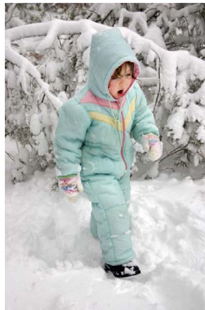
Stepping carefully in the snow . . .